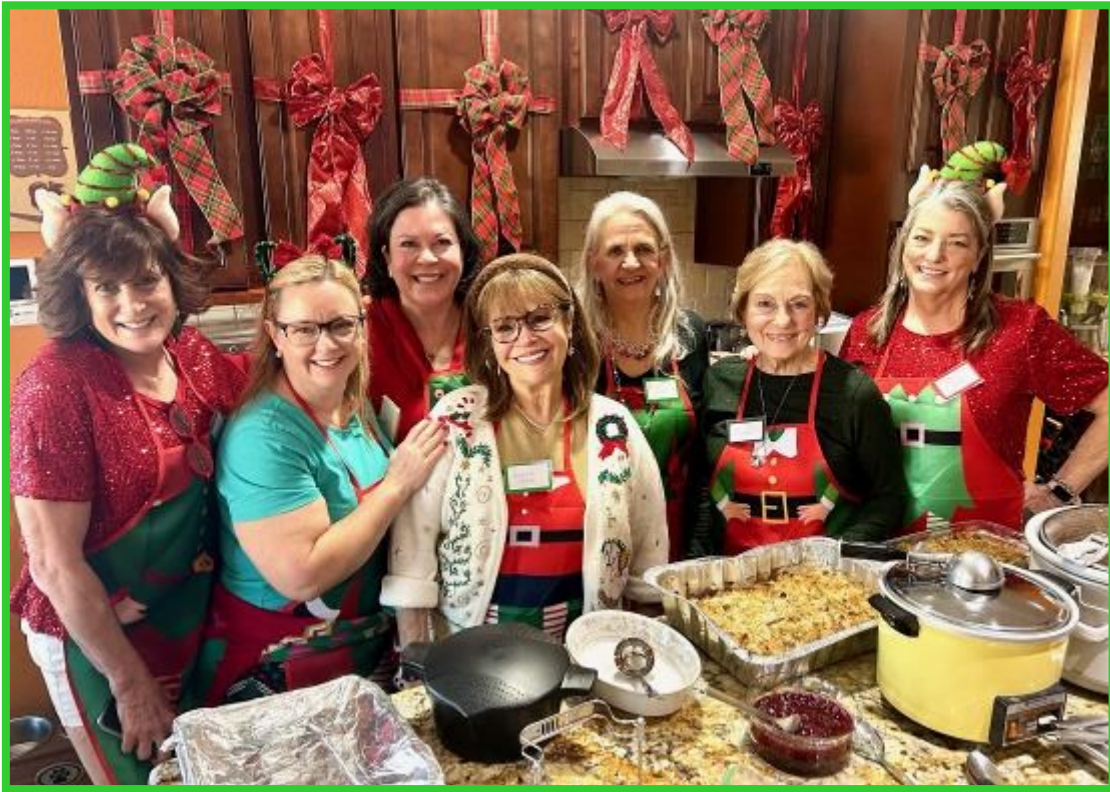
Our Host and Co- Host