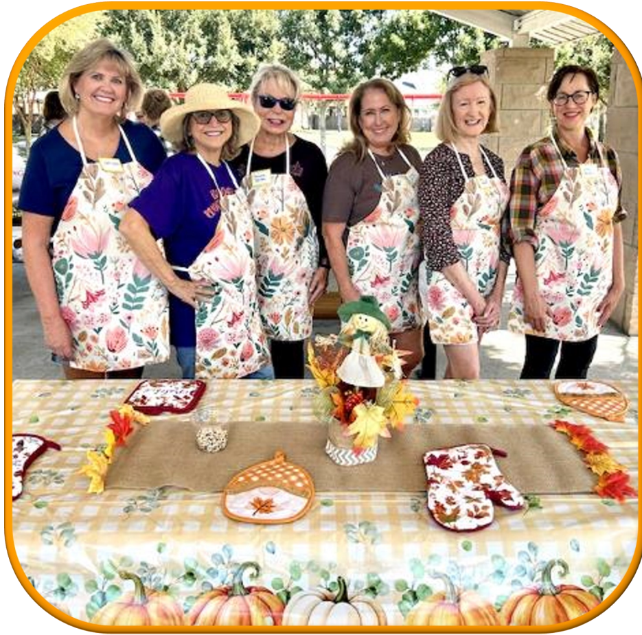
Our Host and Co- Host